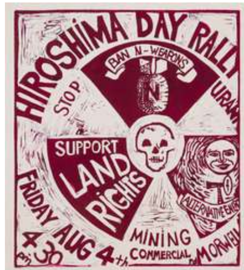
Posters and prints from the arc collection.