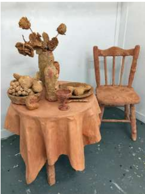
An exhibition by Christopher Miller that will focus on growth, colour and texture.

These works have been driven by how the physical nature of an object can shift based on our expectation and visual appearance of said objects. A shift in normality changes both the viewers' expectation and perception of an object. The viewer is forced to question if they can look beyond the perceived surface qualities to appreciate the actual object in its role and value. Opening event on Saturday 9 June from 2pm.