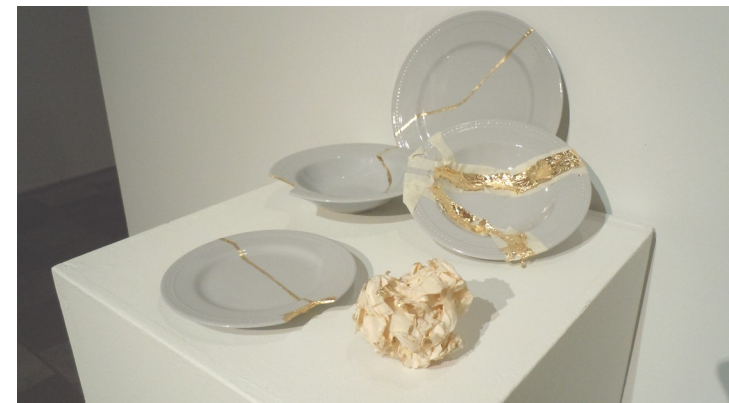
The Golden Repair- Olivia Cooke